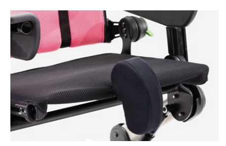
834N Narrow abduction block Available in two sizes.