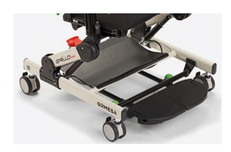
959 Set of 4 wheels with brakes as an alternative to the 4 black glides. 75 mm swivel wheels all equipped with brakes. Supplied with footrest.

For easy transport and storage. Allows the transfer even with the child seated.