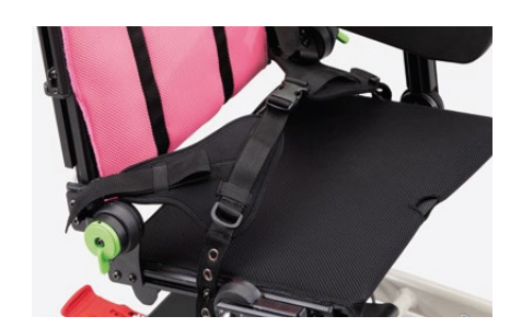
920 Four point pelvic belt Available in two sizes.