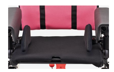
958R Padded pelvic side supports Adjustable in width, rotation and depth.