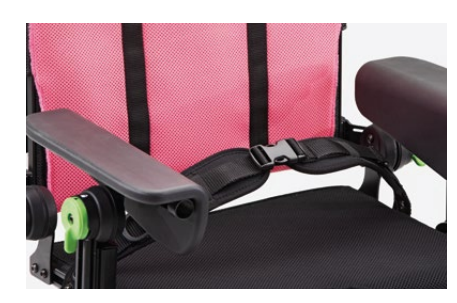
947 Pelvic belt with variable angle Available in three sizes.