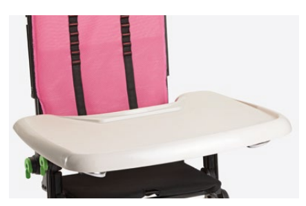
824 Tray with wrap-around recess Adjustable in depth, height and tilt with armrests.

It is made of resistant and hygiene material, no edge design, it does not retain any residue of food.