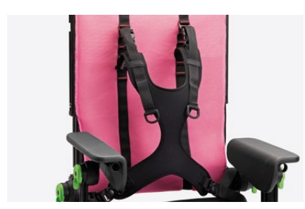
853 slim Four point shaped harness