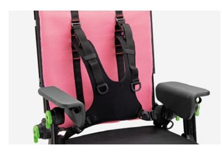
853 Vest harness Available in two sizes.